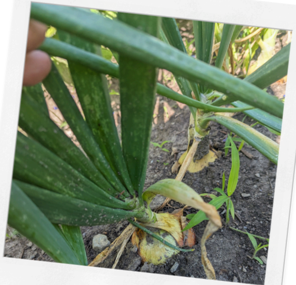
Aspire Program 2023 Summer Garden