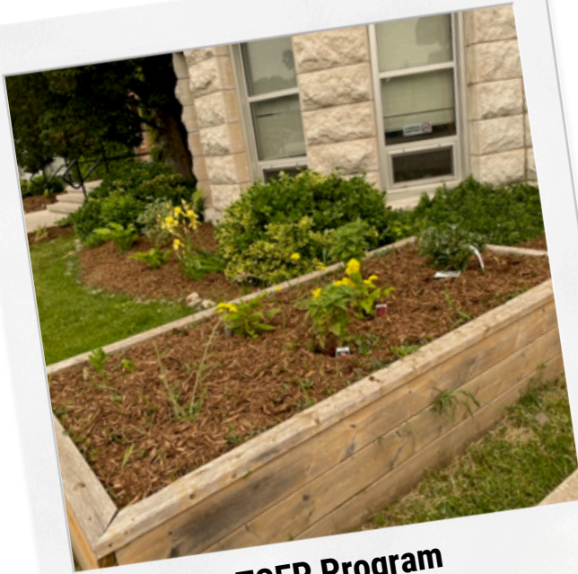
LTSEP Program PACE Garden Project