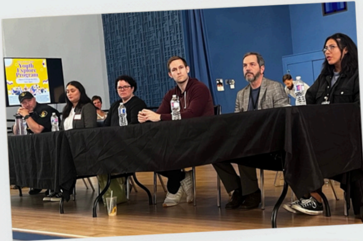
Aspire Program Career Panel at New Canadians Centre