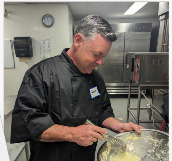
Aspire Program Cooking Workshop Series