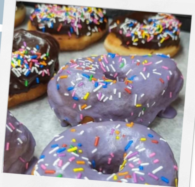
Aspire Program Tragically Dipped Donut Decorating Party