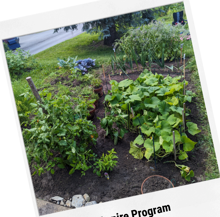
Aspire Program 2023 Summer Garden