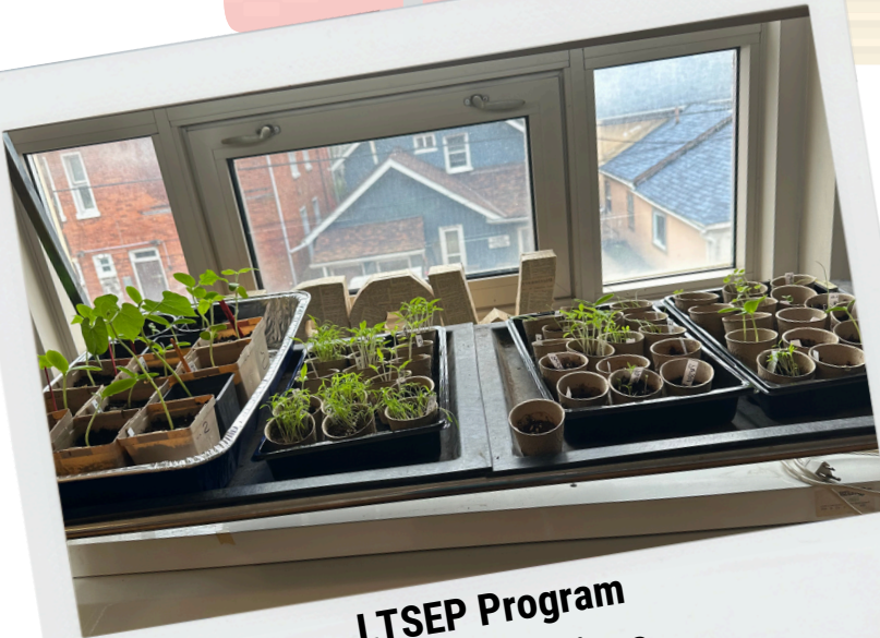
LTSEP Program Garden Seedlings