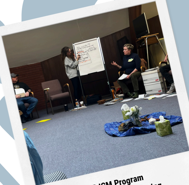
RJCM Program 2023 Mediation Training