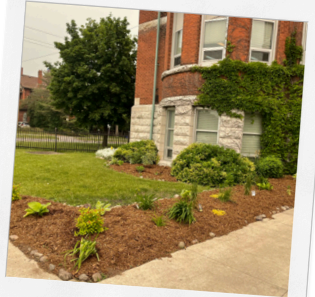
LTSEP Program PACE Garden Project