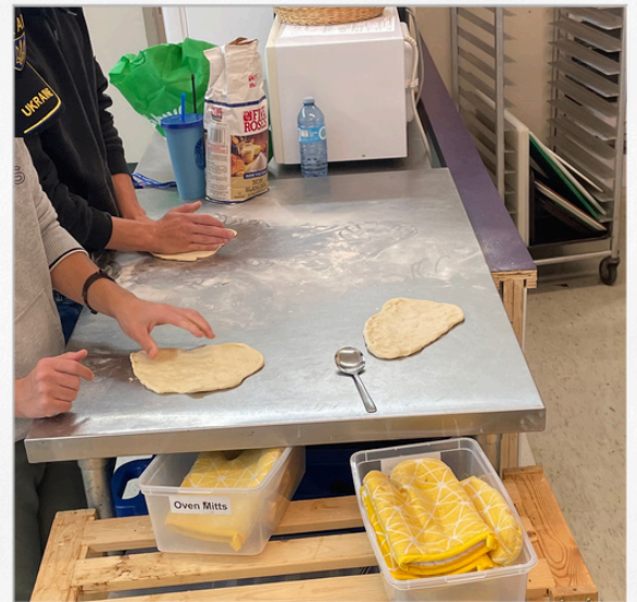
LTSEP Program Lunch & Life Skills