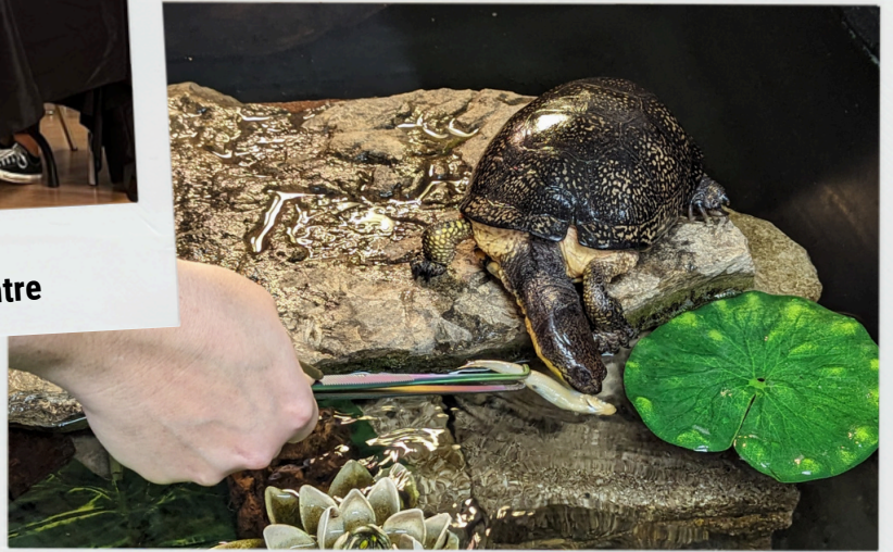
Aspire Program Informational Interview & Tour of Kawartha Turtle Sanctuary