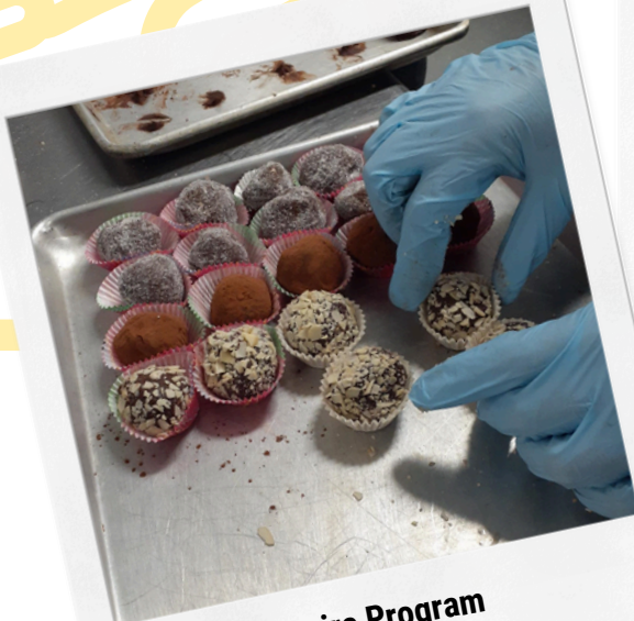
Aspire Program Cooking Workshop Series