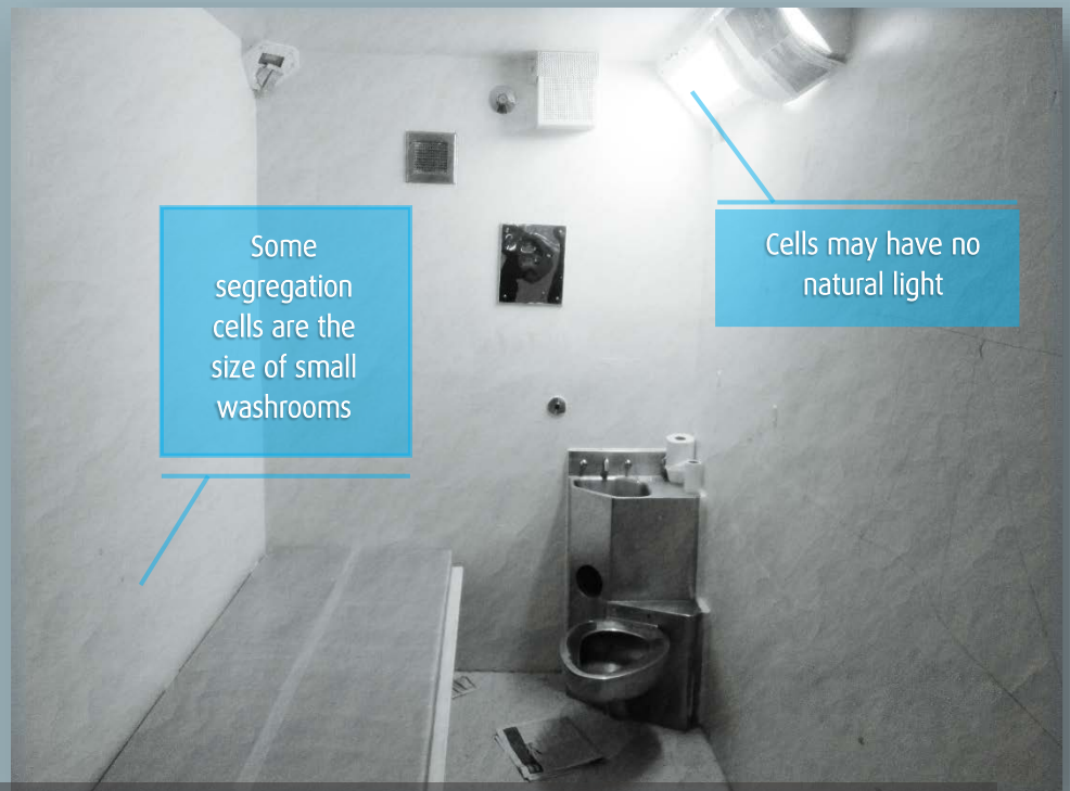
These are images of federal solitary confinement cells obtained from the Office of the Correctional Investigator